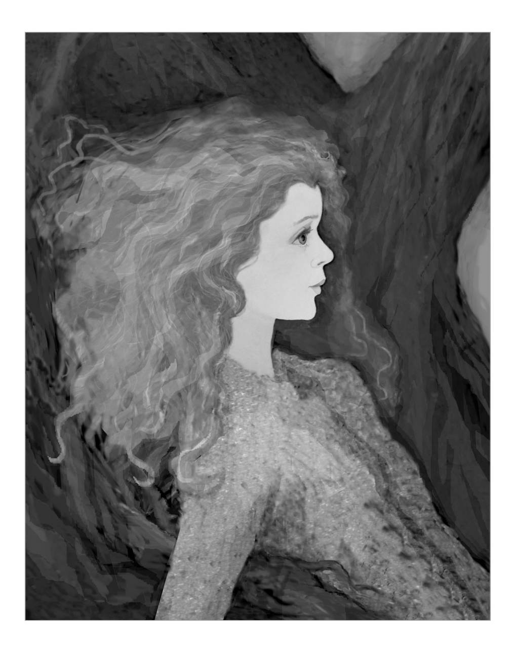
I'm absolutely mortified just thinking about last night!